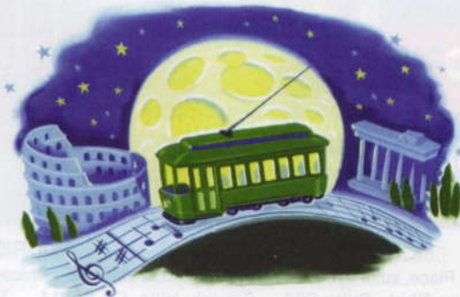
Illustrated by RYAN HESHKA

What could be more romantic than a candlelit dinner on a 1940's tram with Rome's Colosseum and live jazz music as your backdrop? On the recently launched Tramjazz ( tramjazz.com ; tickets for two $160) tour, you'll drive by historic sites lit up at night while enjoying plates of eggplant lasagna and ricotta tart. The best part? Your traveling companions include a troupe of local musicians. —VALERIE WATERHOUSE